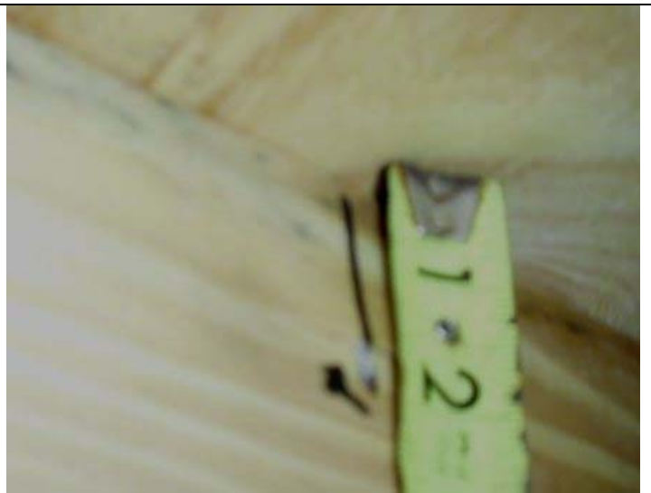
Roof deck attachment