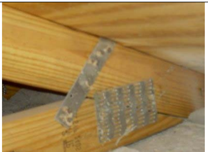
Roof to wall attachment