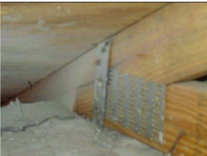
Roof to wall attachment