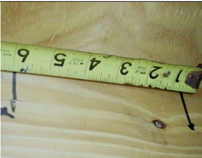
Roof deck attachment